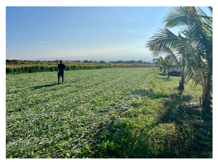
This layer of sun hemp is used as a cover crop as part of the soil health process.

Another important factor that will determine the future and success of local food production is long-term soil health. ADC is part of a working group to study and push for initiatives to improve soil health for farming.