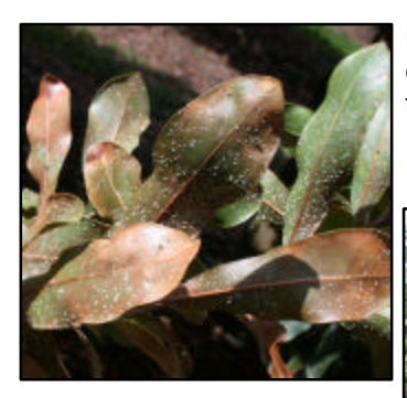
Figure 4 . Macadamia felted coccid infesting macadamia foliage.

Damage. Ironside (1978) reports that the MFC infests all above-ground parts of trees (Figures 2-4). It distorts and stunts new growth and causes yellow spotting on older leaves. Severe infestations can cause dieback (Figure 5). On bearing trees, nut yields are reduced and a delay is caused in the fall of mature nuts.