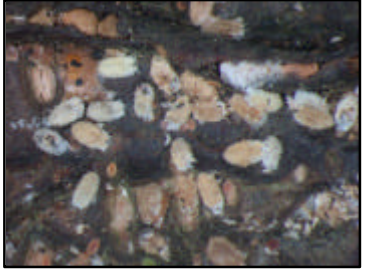
Figure 3 . Macadamia felted coccid infesting macadamia nuts.

Distribution and Hosts. The macadamia felted coccid is native to Australia. Its host plants are restricted to smooth and rough-shelled macadamia (Jones 2002). On the Big Island, infestations of the scale have been found at Honomalino in South Kona. No infestations have been reported on the other neighboring islands.