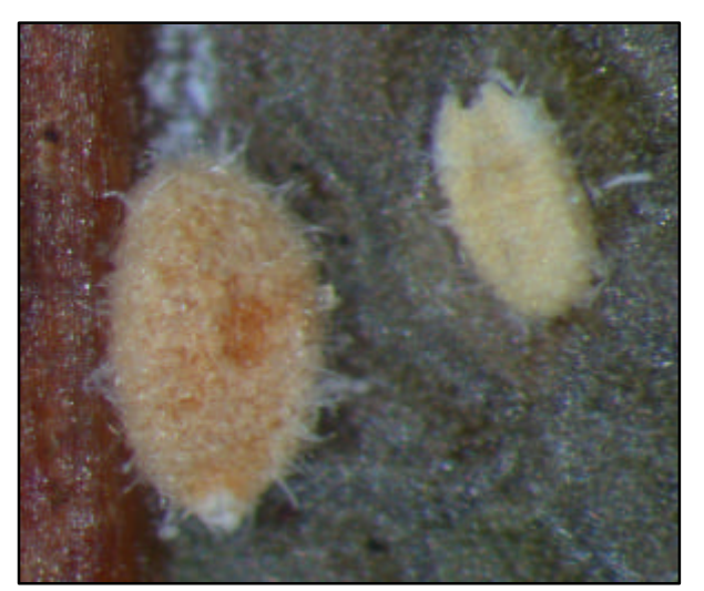
Figure 1 . Macadamia felted coccid. Enlarged photo of adult female (left) and male pupa (right). Actual length of female is less than 1 mm.