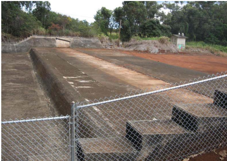
The spillway area at the Wahiawa Reservoir