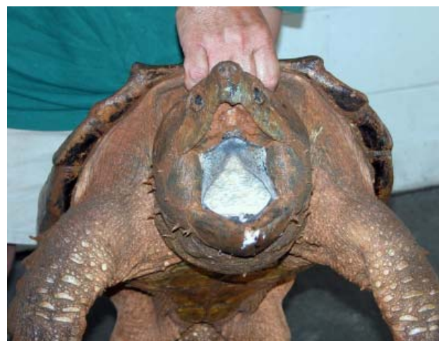
Snapping turtle captured by a resident near Lake Wilson in Wahiawa. The turtle weighed 52 lbs.