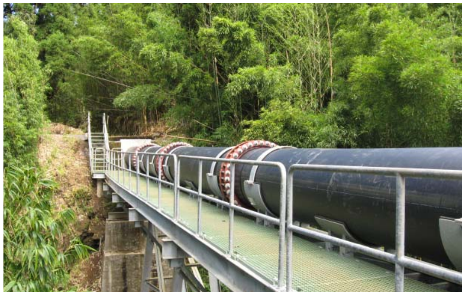
Repairs to Waimea Irrigation System Flume #1 after it was suffered severe earthquake damage in October 2006.

During this time, Ayako grew fragrant tuberose on four acres of leased State land in Waimanalo. Kazuto, working as a chemist, also attempted to produce orchids and other crops, however, found difficulty in maintaining consistency in a quality commodity which was economically viable. Ayako established sales of the fragrant tuberose to the lei vendors of the Honolulu International Airport.