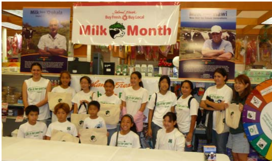
Eager 4-Hers on Hawai'i Island help promote Milk Month at the Puainako KTA Superstore.