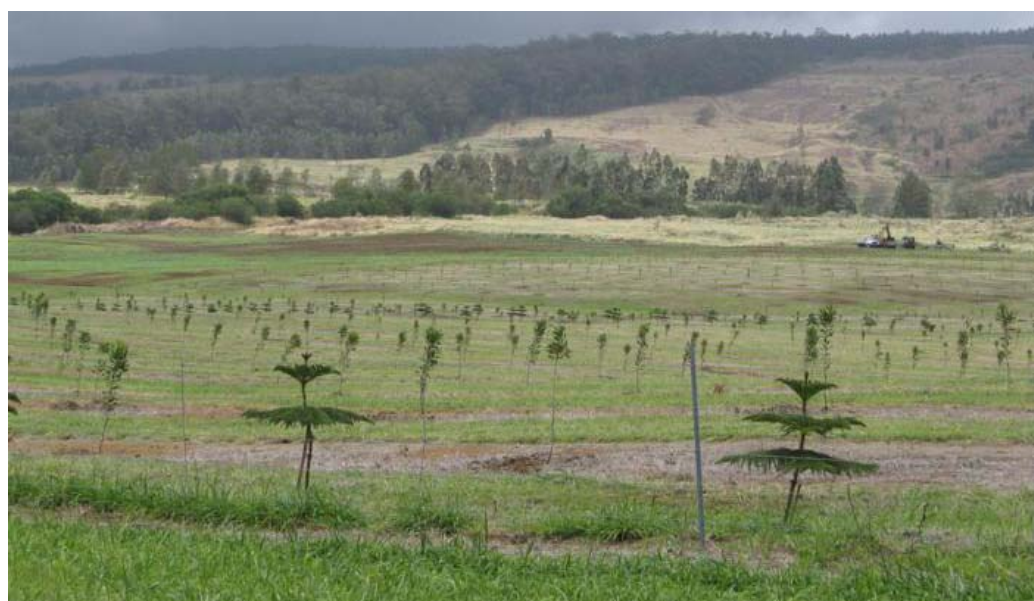
New plantings of Norfolk pine in Ka'u

Although there were no actions taken after an initial meeting between ADC and Dole, negotiations are ongoing. The Wahiawa reservoir and dam issues are also directly related to the Galbraith Estate land, another project involving ADC.