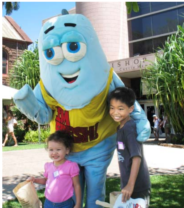
ADP mascot, Freshy the Fish, poses with some newfound friends at the Hawai'i State Farm Fair at the Bishop Museum.