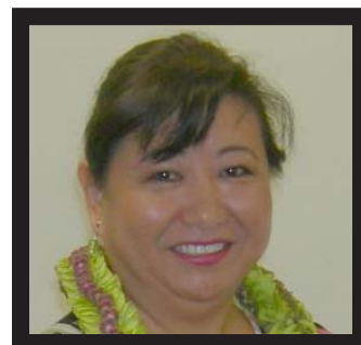
HDOA Manager of the Year