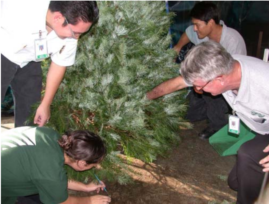
Plant Quarantine inspectors shake down every Christmas tree in containers where hitchhiking pests have been found during the initial inspection at the dock.

the unavailability of appropriate facilities. In order to address the need for a consolidated inspection facility, a study was funded to: