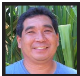
State Employee of the Year & HDOA Employee of the Year