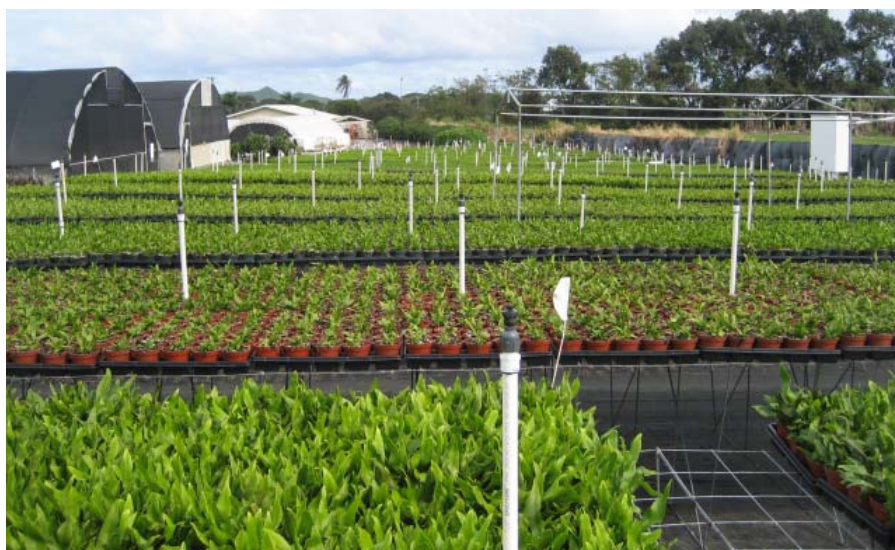
Hawaiian Sunshine Nursery, Panaewa Agricultural Park, Hawai'i Island

Hawaiian Sunshine Nursery specializes in growing bromeliads and tropical foliage for the retail, landscape, and resort industries. With locations on the Island of Hawai'i (fee and leased) and on O'ahu, Hawaiian Sunshine Nursery produces over 400,000 plants annually for the local and export markets. Their local clients range from independent florists to big box retail outlets and their export markets include the mainland, parts of Europe, Costa Rica, and aspirations towards Japan.