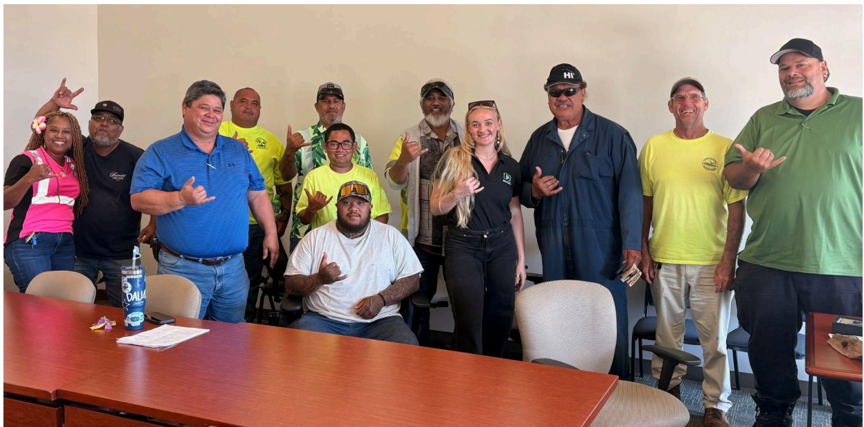
First cohort of trainees! West Hawaii Civic Center, April 2026